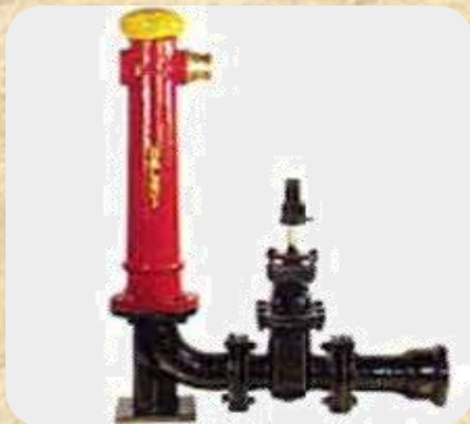
Cast Iron Fire Hydrant Stand Post Set