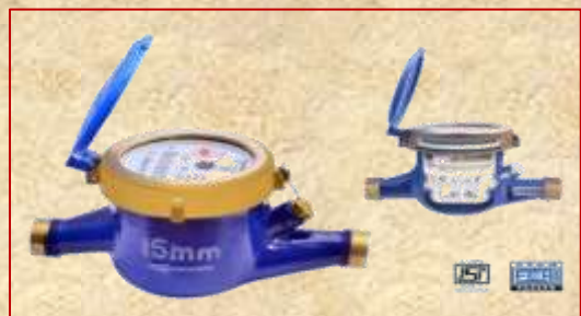
WATER METERS BOX