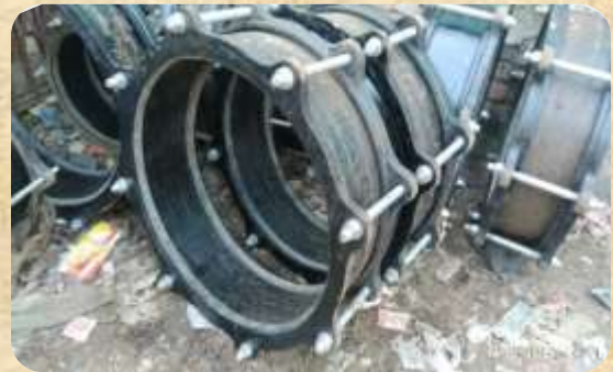
Cast Iron & Ductile Iron Mechanical Joint (M.J.) Coupling, Sizes 80 mm to 1200 mm