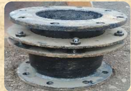
Cast Iron & Ductile Iron Expansion Joint