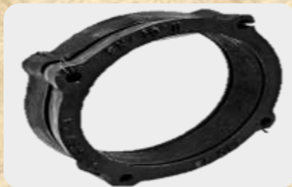
Cast Iron & Ductile Iron Detachable Joint (D.Joint), Class-5, 10, 15, 20, 25.Sizes 80 mm to 1200 mm