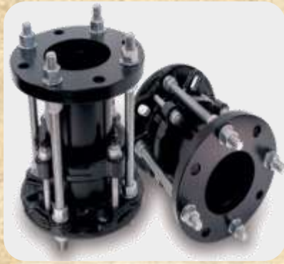
Cast Iron & Ductile Iron Dismantling Joint