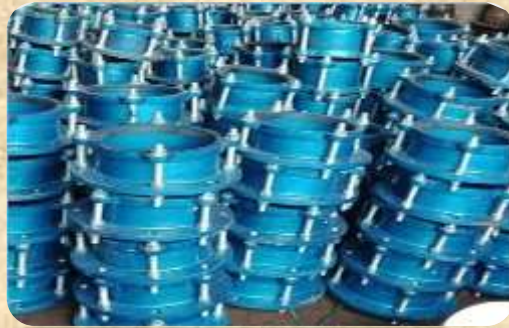
Cast Iron & Ductile Iron Mechanical Joint (M.J.) Flange Adaptor, Sizes 80 mm to 1200 mm