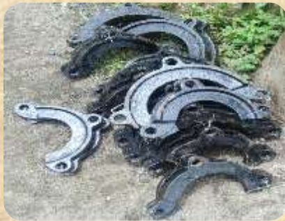
Cast Iron Socket Leak Repair Clamp (LRC), 80 MM to 1000 MM